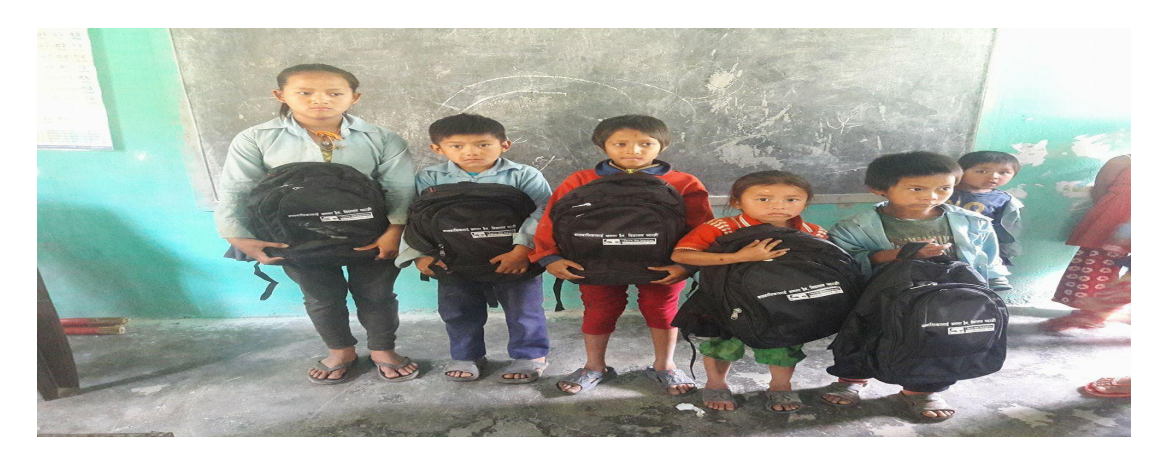
Glimpse of education support at Shree Rastriya Primary school, Myagang