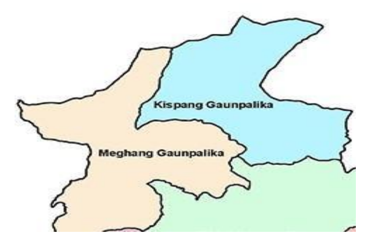
Map of Project Rural Municipal Unit namely Myagang and Kispang, Nuwakot

Myagang and Kispang Rural Municipal is lies in far north part of Nuwakot district. It is situated in province no.3 of Bagmati Zone Nepal. The total land area of Project area is adjoining with Dhading, Rasuwa district and Bidur Municipality of Nuwakot.