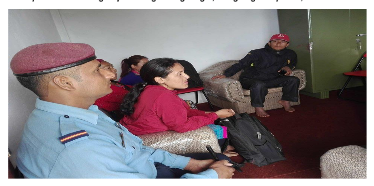
Glimpse of LCCHT meeting on April 10, 2018 at meghang-3, Deurali